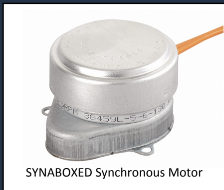
SYNABOXED Synchronous Motor