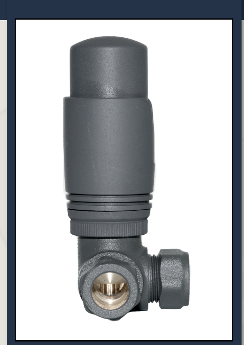
CORNER TRV ANTHRACITE