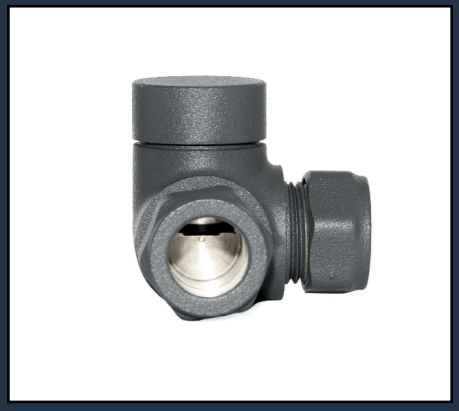
CORNER LOCKSHIELD ANTHRACITE